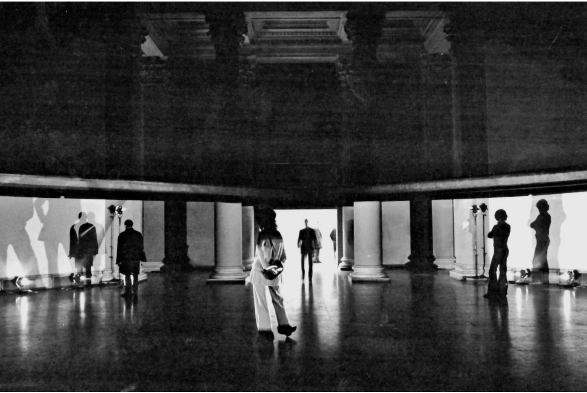
Figure 1.3. Piero Sartogo, entrance to Vitalità del negativo , 1970.