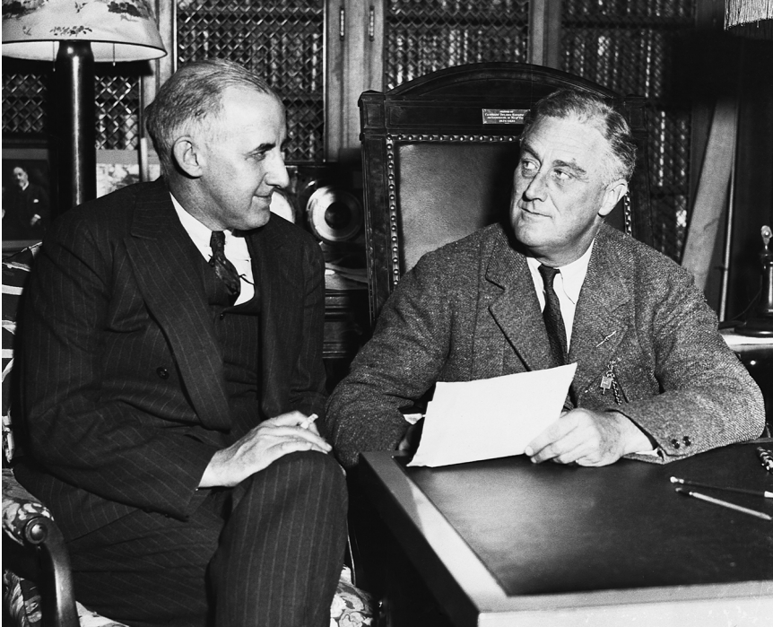
FIGURE 1.1. Raymond Moley, the head of the Brains Trust, and President Franklin Delano Roosevelt in February 1933.

avoided by careful planning through a national economic council run by the private sector and coordinated by the government. After visiting the Soviet Union in the late 1920s, he became an even stronger believer in the merits of economic planning. Although he was a tenured professor at Columbia, he was not a member of the Graduate School, and his teaching was confined to undergraduates. Years later he would write that talking about economics with Roosevelt was like teaching the rudiments of the discipline to college freshmen. 11