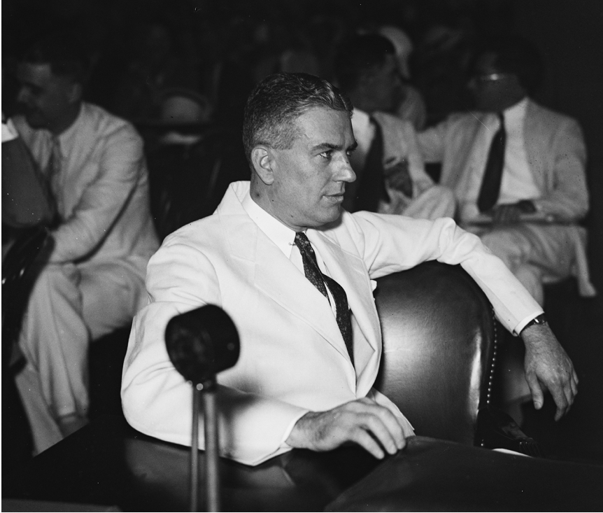
FIGURE 1.2. Rexford G. Tugwell, the only economist in the Brains Trust.

size must be.” 16 In his memoirs, he commented on Roosevelt’s custom of greeting his advisers early in the morning, while still in bed. During those meetings FDR would smoke the first cigarette of the day. Tugwell was always impressed with the vigor with which Roosevelt put the match out, and thought that it had to do with Roosevelt’s handicap: “[B]eing trapped [in case of a fire] is something no one likes to contemplate. For a man without legs it becomes something to guard against as a special risk. The rest of us can make some easy and quick adjustment to circumstances, but a cripple that is otherwise vigorous has not only to see that his escape way is open but also to do so furtively.” 17