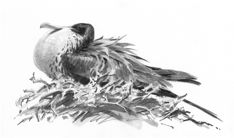
The bare-skinned red throat of a male Magnificent Frigatebird is inflated to attract a mate.

beach, especially when showing off their brightly-coloured feet of which they seem unreasonably proud. Gannets and boobies commonly plunge from a height into the sea to feed.