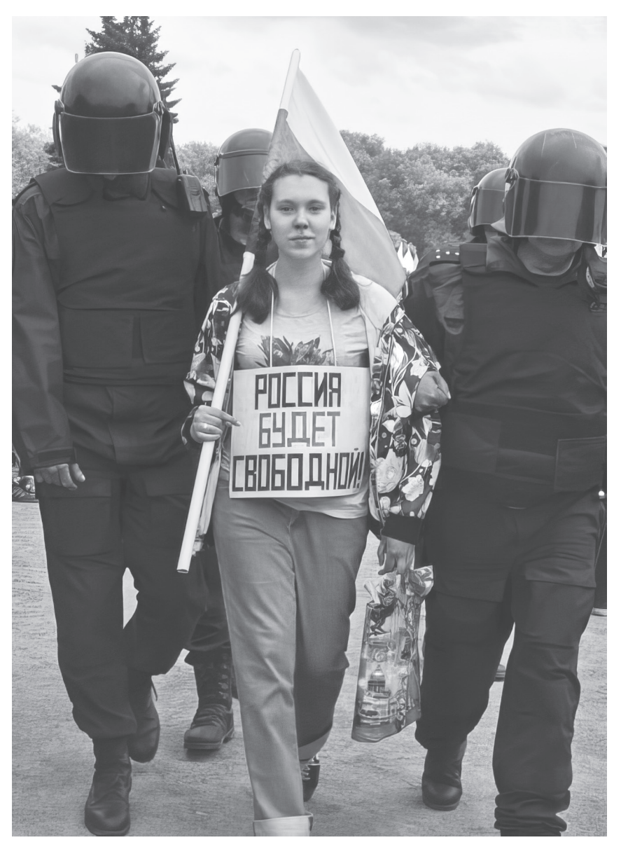
FIGURE 2. "Russia Will Be Free!," unnamed woman, detained in St. Petersburg (2017).