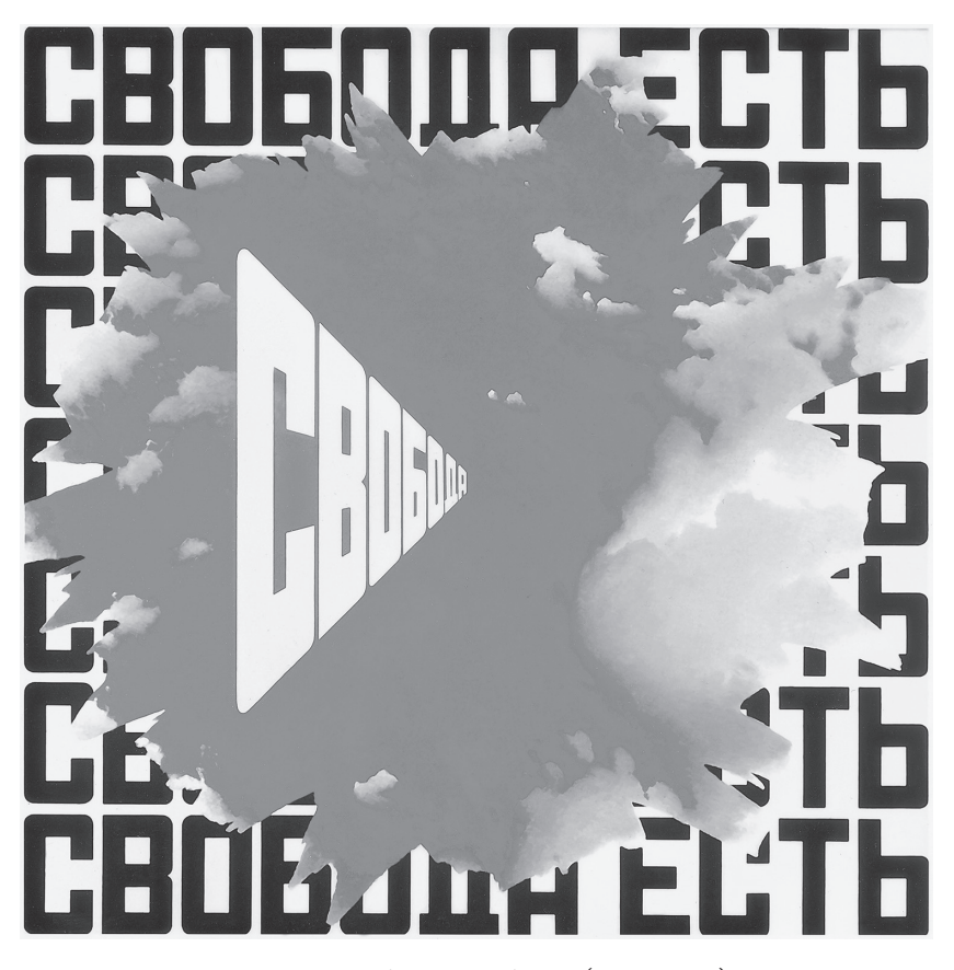
FIGURE 1. Erik Bulatov, Freedom Is Freedom II (2000–2001). Artists Rights Society (ARS), New York

a blue distance of ever-receding space. Bulatov lifts that last word of the poem off the text, creating a grid of identical lines of poetry, rather than replicating the text's asymmetry of that extra word "svoboda" in 1.7. Those repeating words, "svoboda est'," become a grid-like background onto which the blue sky of freedom can be painted.<sup>19</sup>