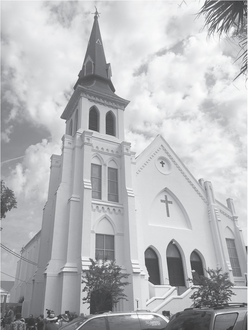
FIGURE 2. Emanuel African Methodist Episcopal Church (present day).