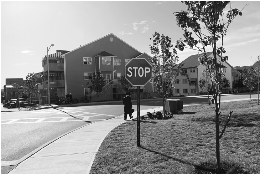
FIGURE 1.3. Man Walking in Front of Typical Multiunit Apartment Buildings in Kiryas Joel.