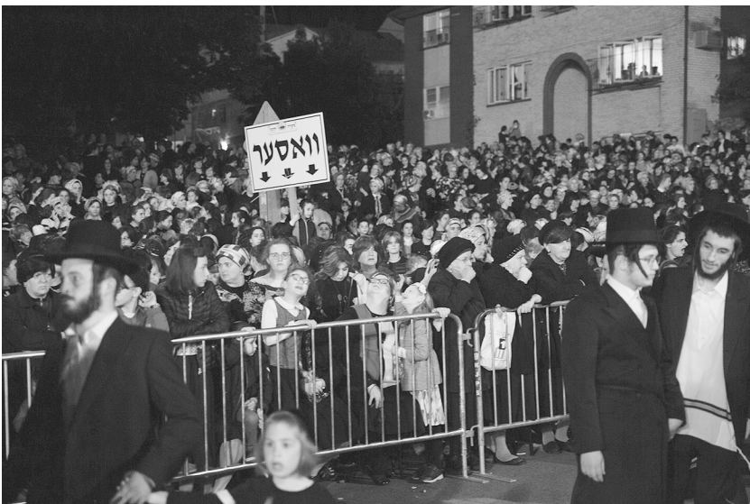
FIGURE 1.9. Women at Lag Ba-Omer Celebration under a Sign for Water, 2019.