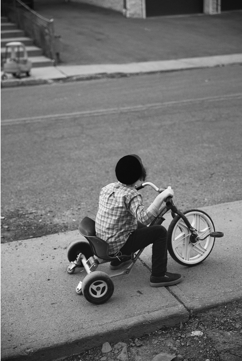
FIGURE 1.5. Young Boy on Big Wheel.