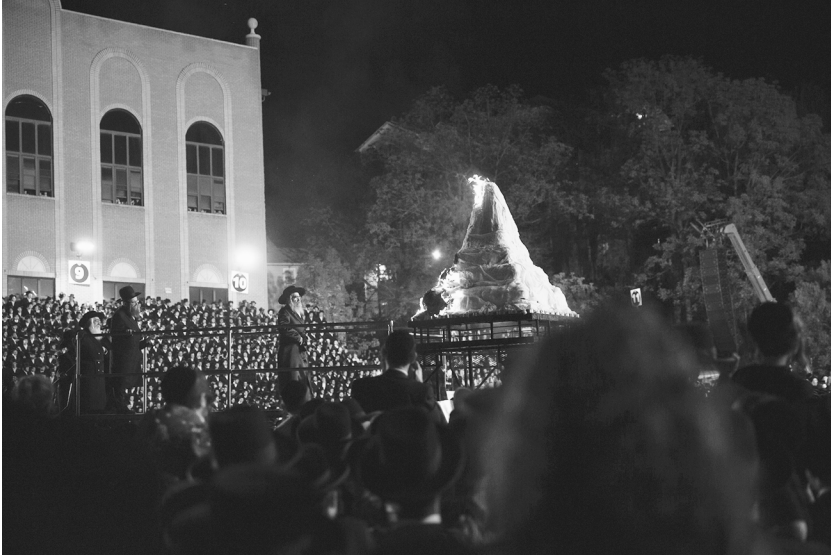
FIGURE 1.8. R. Aaron Lighting Lag Ba-Omer Fire, 2019.