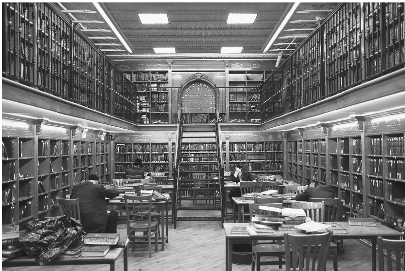
FIGURE 1.6. Men in Study Hall in Main Aroni Synagogue.

men to lengthen the time they study in kollel , the religious institution in which married men study on a full-time basis. The trend represents a curious kind of religious innovation, one that pushes toward a more traditionalist or stringent form of religious life and inverts the original Hasidic impulse to reject the overly intellectual study-based approach of rabbinic Judaism.