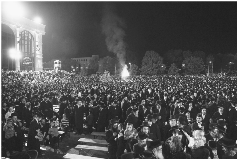
FIGURE 1.10. Crowd of Men and Boys Gathered for Lag Ba-Omer Celebration.