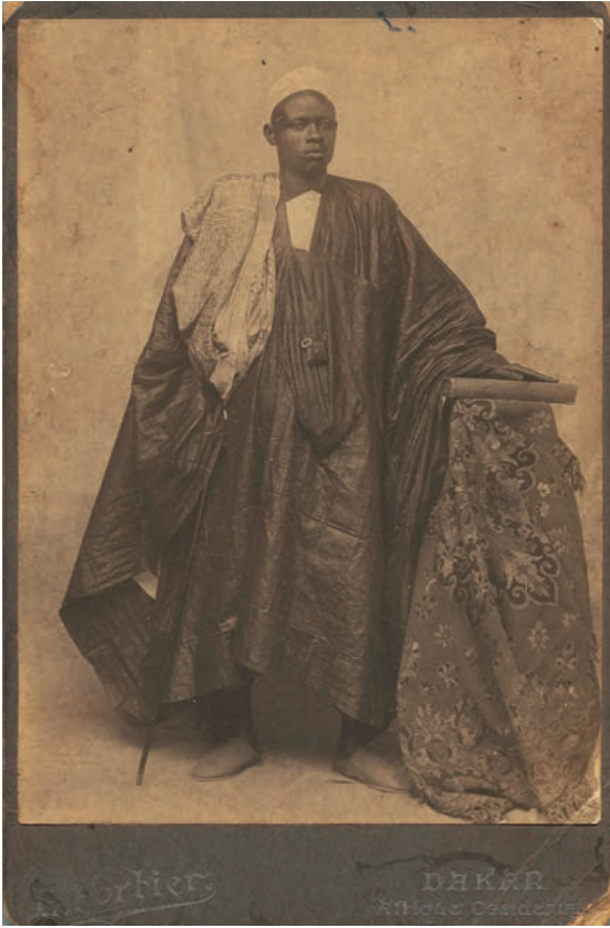
Fig. 0.3. François-Edmond Fortier, Photograph, 1900–1910. Gelatin silver print, 6 1/2 × 4 1/4 in. (16.5 × 10.8 cm).