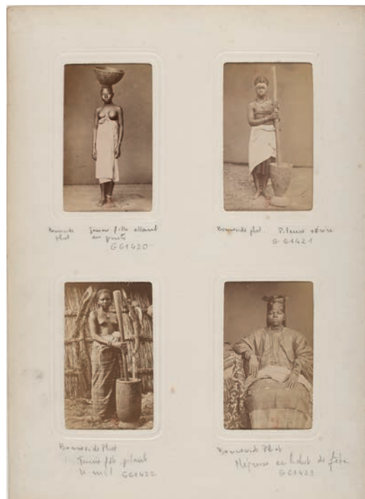
Fig. 0.8. Bonneville, Paysages et types des mœurs du Sénégal , 1880s. Detail of album.