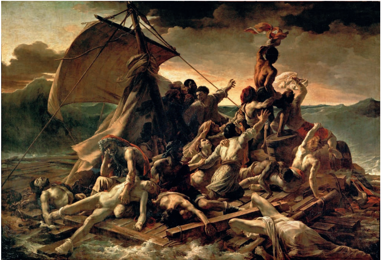
Fig. 1.1. Théodore Géricault, The Raft of the Medusa , 1819. Oil on canvas, 193 1/2 × 282 1/10 in. (491.5 × 716.5 cm).