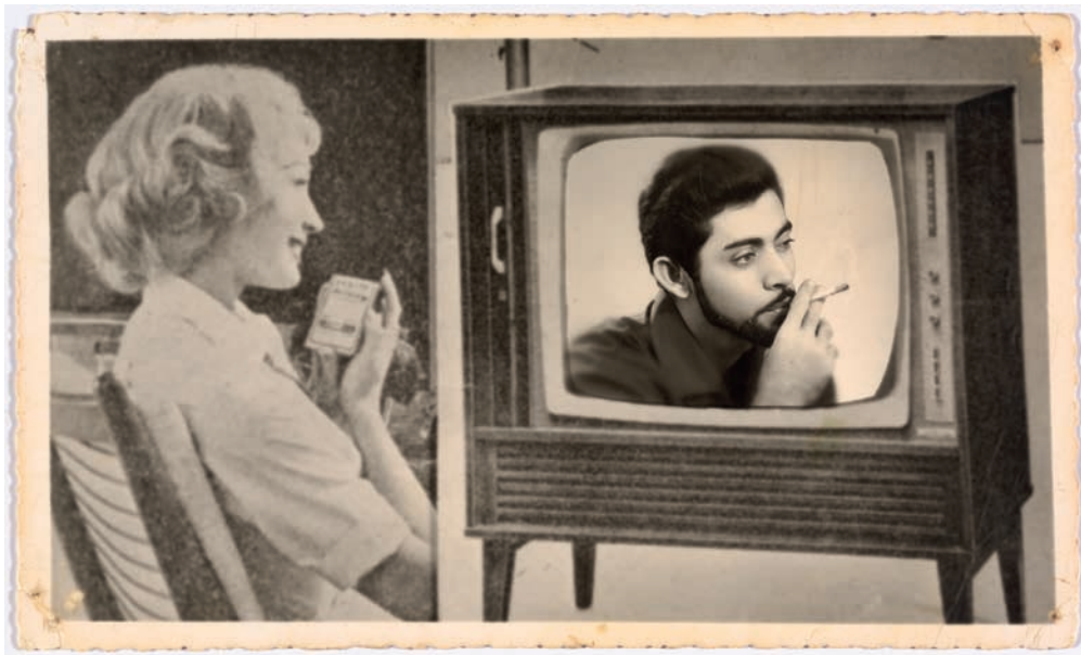
Fig. 0.10. Youssef Safieddine, Self portrait of Youssef Safieddine, Dakar, Senegal. Gelatin silver developing-out paper print, 7.5 x 12.9 cm. 1966.