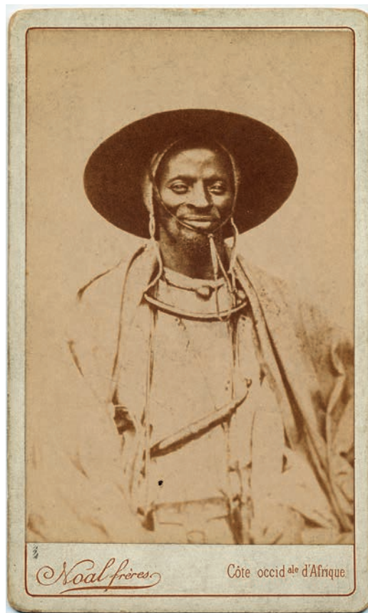
Fig. 0.5. Bonnevide, King of Dakar, c. 1870s. Carte de visite, 2.5 x 4 in. (6.4 x 10.2 cm). Published by Noal frères, c. 1875.

For his portrait, the king had chosen to sit with his hands on his lap (fig. 0.5). With his torso at an angle, he turns his head to face the camera. The wide hat resting on a smaller cotton bonnet protects him from the sun. A voluminous