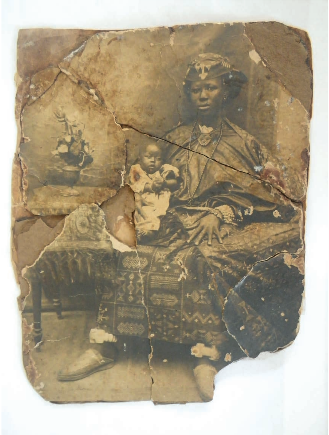
Fig. 0.2. Unidentified photographer, Woman posing with infant, c. 1890s–1900s. Cabinet card.