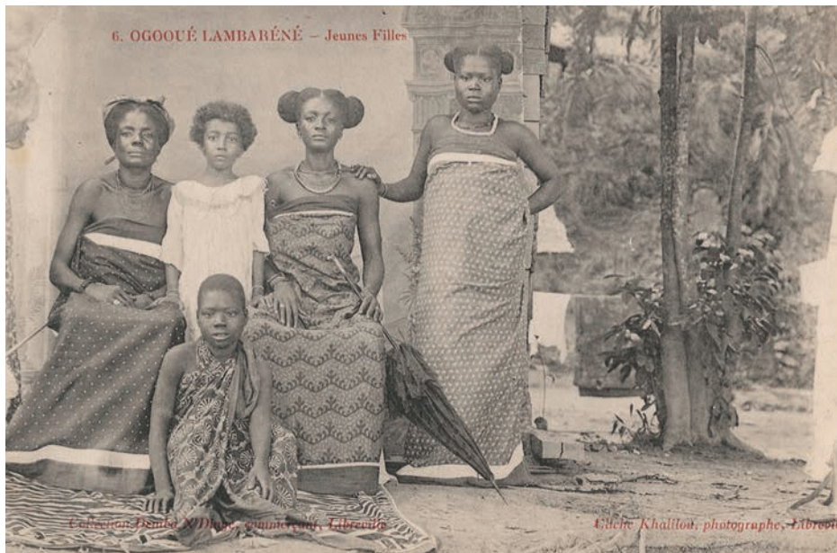
Fig. 0.11. Khalilou, Ogooué Lambaréné—Young girls, early 20th century. Postcard format photomechanical reproduction, 3 1/4 × 5 1/4 in. (8.3 × 13.3 cm). Published by Demba N'Diaye, Libreville, Gabon.

Because of the nature of both the research and the photographic, this book had to renounce overly linear or comprehensive approaches. While the book is organized chronologically, it is not linear; it includes multiple moments where specific subjects and objects take the reader back and forward in time. Like the photographic wall of the xoymet , where images are reprinted, photographs across the book return in a recursive manner. In its structure, the book weaves connections across the chapters, with images that return, at times as copies, at other times as visual citations. The book maintains the mapping structure of the xoymet , which seeks to entice, but only by offering a glimpse. Its narration is often episodic, and as such, much is left out. So, for instance, I address only in passing famous photographers like Mëïssa Gaye, regarded as one of the pioneers of photography in Senegal; François-Edmond Fortier (see fig. 0.3), one of the most prolific authors in the age of the postcards; and lesser known Senegalese photo entrepreneurs traveling across the continent such as Demba N'Diaye (fig. 0.11). Instead, the book, like the xoymet , accounts for something more intimate and organic in its relations. It traces some of the centrifugal paths these photographs take, always pulling elsewhere.