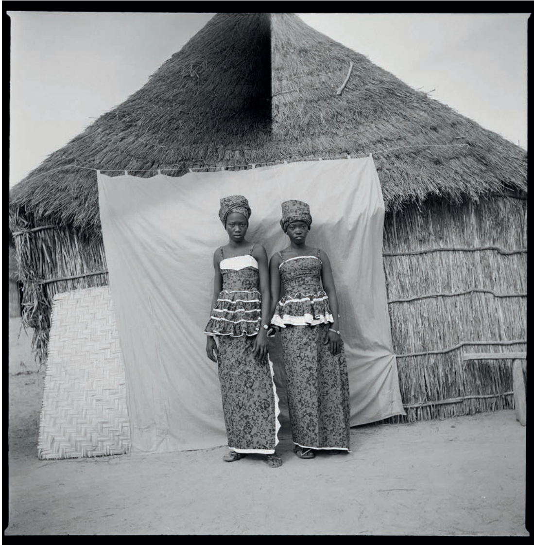
Fig. 0.13. Oumar Ka, Two Women in Front of a Thatched-Roof House, 1959–1968. Scan from gelatin negative, 2.4 x 2.4 in. (6 x 6 cm).