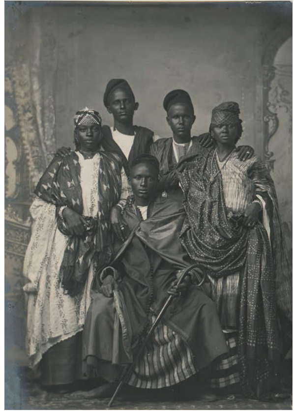
Fig. 0.4. Emile Noal, Groupe d'O'lofs Sénégalais à St-Louis , c. 1890–1900. Print on baryta paper, 5 x 7 in. (12.1 x 16.9 cm).

ground of incomprehension, even untranslatability.” 3 I account for a diverse group of photographers and patrons, media and aesthetics in order to undo the imperial and Eurocentric chronicle that has constituted photography’s metanarrative. This book zooms into that middle ground of negotiation and compromise, a meeting place that can transform “our sense of photography.” As such, the photograph appears as a moving image that demands we stop looking at it and “instead start watching it,” as it negotiates the visible. 4