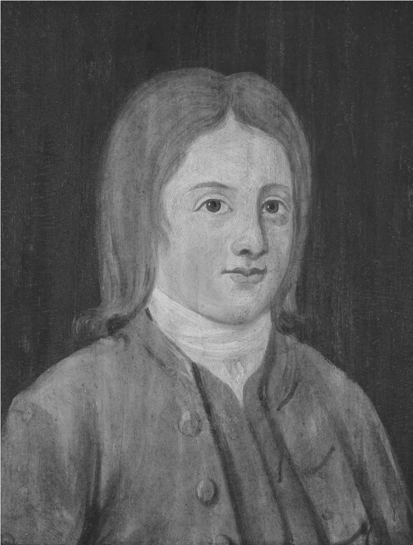
FIGURE 4. The young Linnaeus? Unknown artist, oil painting in the art collection of the Småland Museum, Växjö.

palpate the sufferer's pulse, make as if to use a thumb lancet of wood (for bloodletting), and search for herbs with which to cure his sisters." 14 As a boy, Linnaeus played at medicine and, by his own system, he was then at the third age of life "when, by running hither and thither in constant pre-occupation, the child practices his body incessantly, day after day"—as he would later describe it. 15