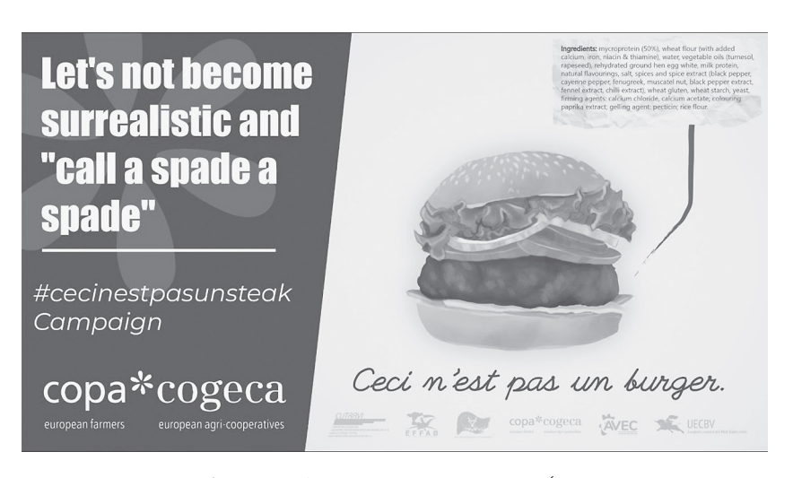
FIGURE 1.4. Ceci n'est pas un burger. COPA-COGECA (Committee of Professional Agricultural Organisations—General Confederation of Agricultural Cooperatives in the European Union). https://copa-cogeca.eu

As usual, the dairy wars have a semantic front. <sup>60</sup> Dairy lobbies will push for bans on "dairy-style names" for plant-based products, as the European Court of Justice did in June 2017 and the European Parliament reaffirmed and extended in October 2020. They banned any reference or parallel to dairy—for example, yogurt-style, cheese-style, cheese substitute, dairy substitute, milky taste (excepting the well-established 'peanut butter' and 'coconut milk'). These lobbies can thereby attempt to control and police the extension of the words 'Milch,' 'leite,' 'formaggio,' 'queso,' 'beurre,' and so on. Attempt to legally control and police it, that is, because ordinary language isn't so docile. As a consequence, vegan products are forced to get creative and come up with alternative names: 'cheeze,' 'drink' (instead of 'milk'), or 'block' (instead of 'butter').