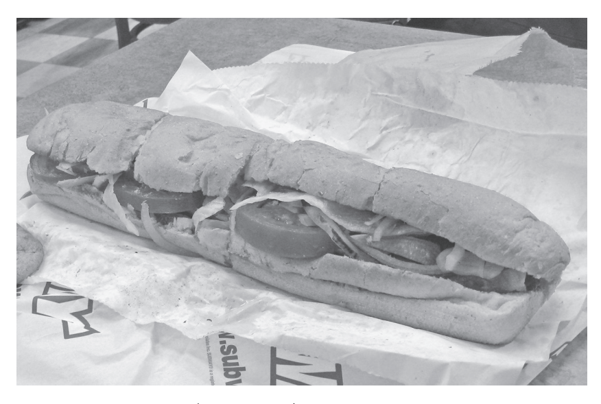
FIGURE 1.3. Not bread (níl sé sin arán). Thanks to Sarah Moriarty for the Irish translation. This file is licensed under the Creative Commons Attribution-Share Alike 3.0 Unported license.

The Irish Supreme Court's decision might have been legally impeccable, given the facts of the case, statutory definition, and pertinent laws. Its assignment wasn't to reveal the essence of bread. Still: why "fat, sugar and bread improver . . . shall not exceed 2 per cent" of the weight of flour? Why is this the correct definition of 'bread'? I grant that I might be raising trick questions. Perhaps there can't be a non-arbitrary percentage of flour. The law's cut-off point must be to some extent, or wholly, arbitrary. While justifications pretend to be well-grounded, they're actually just that: justifications. Legal institutions' face-work.<sup>43</sup>