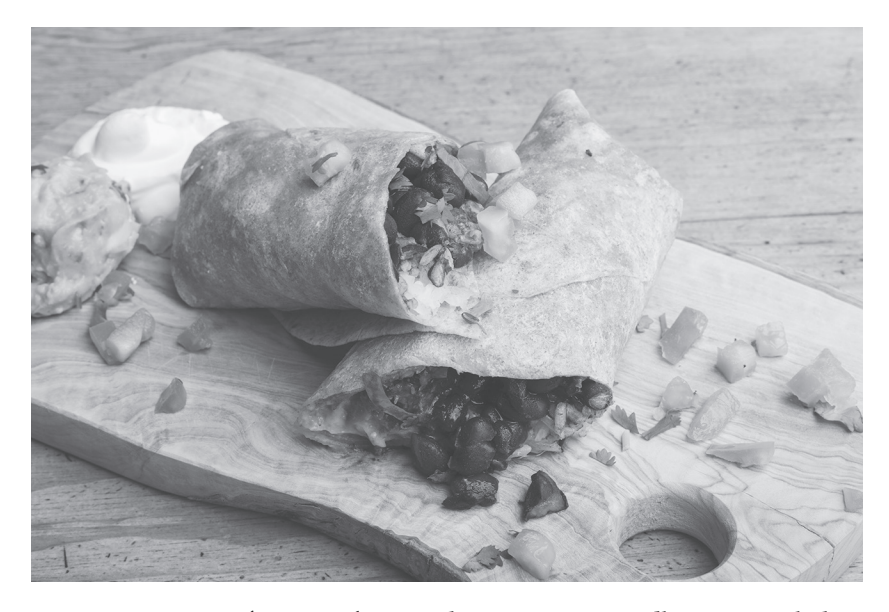
FIGURE 1.2. Ceci n'est pas un burrito . Photo: Creative Headline on Unsplash. Free to use under the Unsplash License.

quesadillas, the bread is the tortilla. [\ldots] All authorities recognize tortillas as a form of bread. <sup>28</sup>