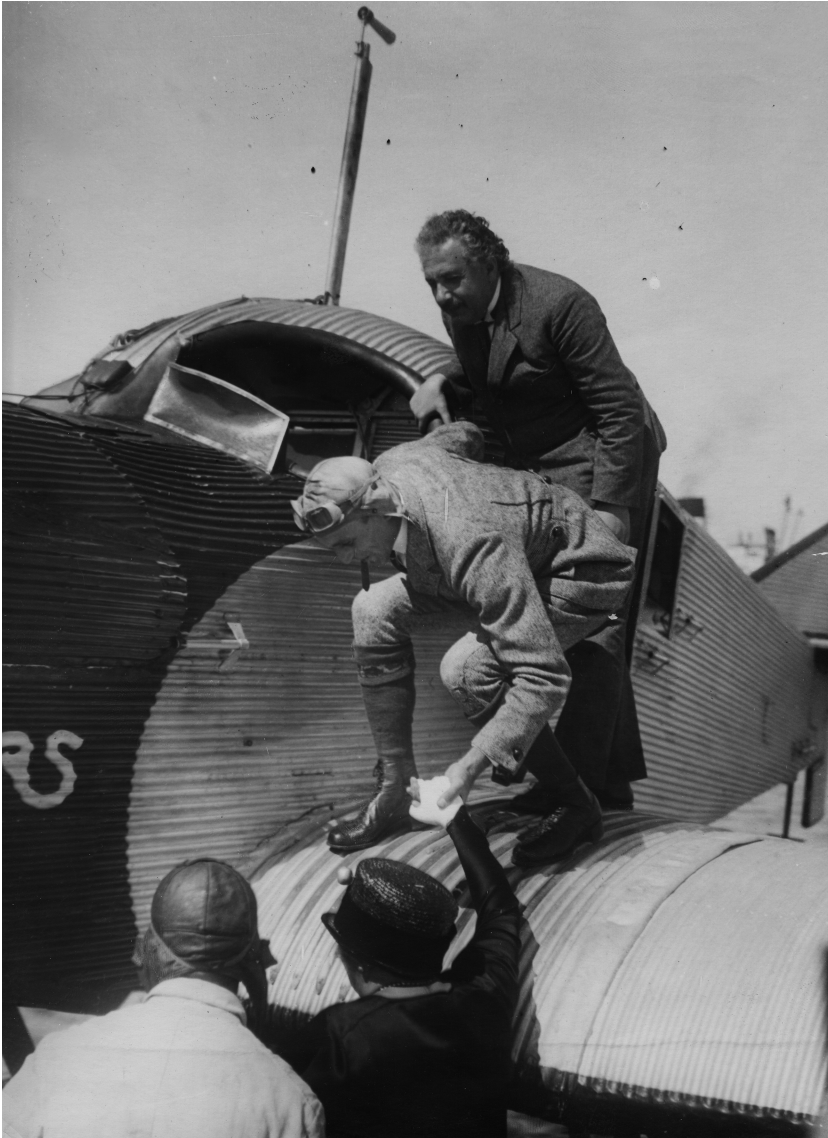
4. Einstein and Berta Wassermann-Bornberg, Junkers hydroplane, Buenos Aires, 1 April 1925 (Courtesy Leo Baeck Institute, New York).