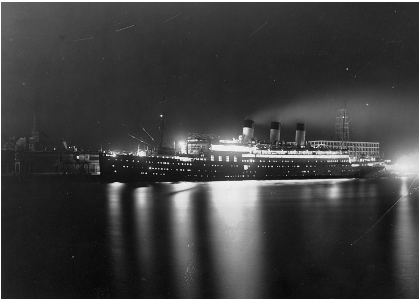
1. S.S. Cap Polonio, Montevideo harbor at night.