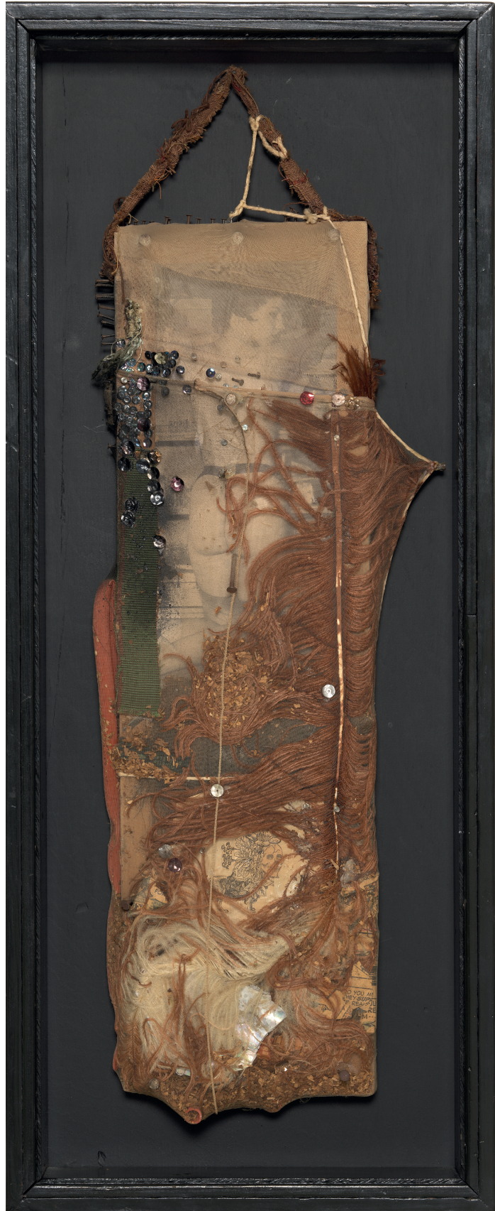
12 Bruce Conner, BLACK DAHLIA, 1960, mixed media, 67.9 × 27.3 × 7 cm, Museum of Modern Art, New York