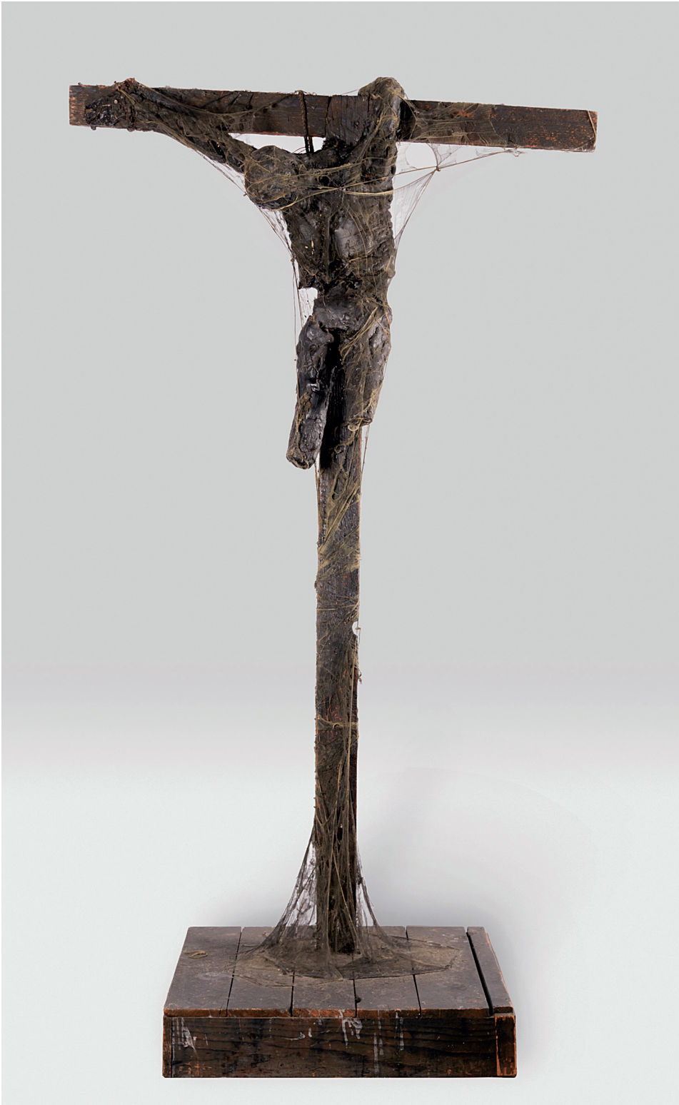
16 Bruce Conner, CRUCIFIXION, 1960, mixed media, 215.9 × 119.4 × 69.9 cm, di Rosa Collection, Napa