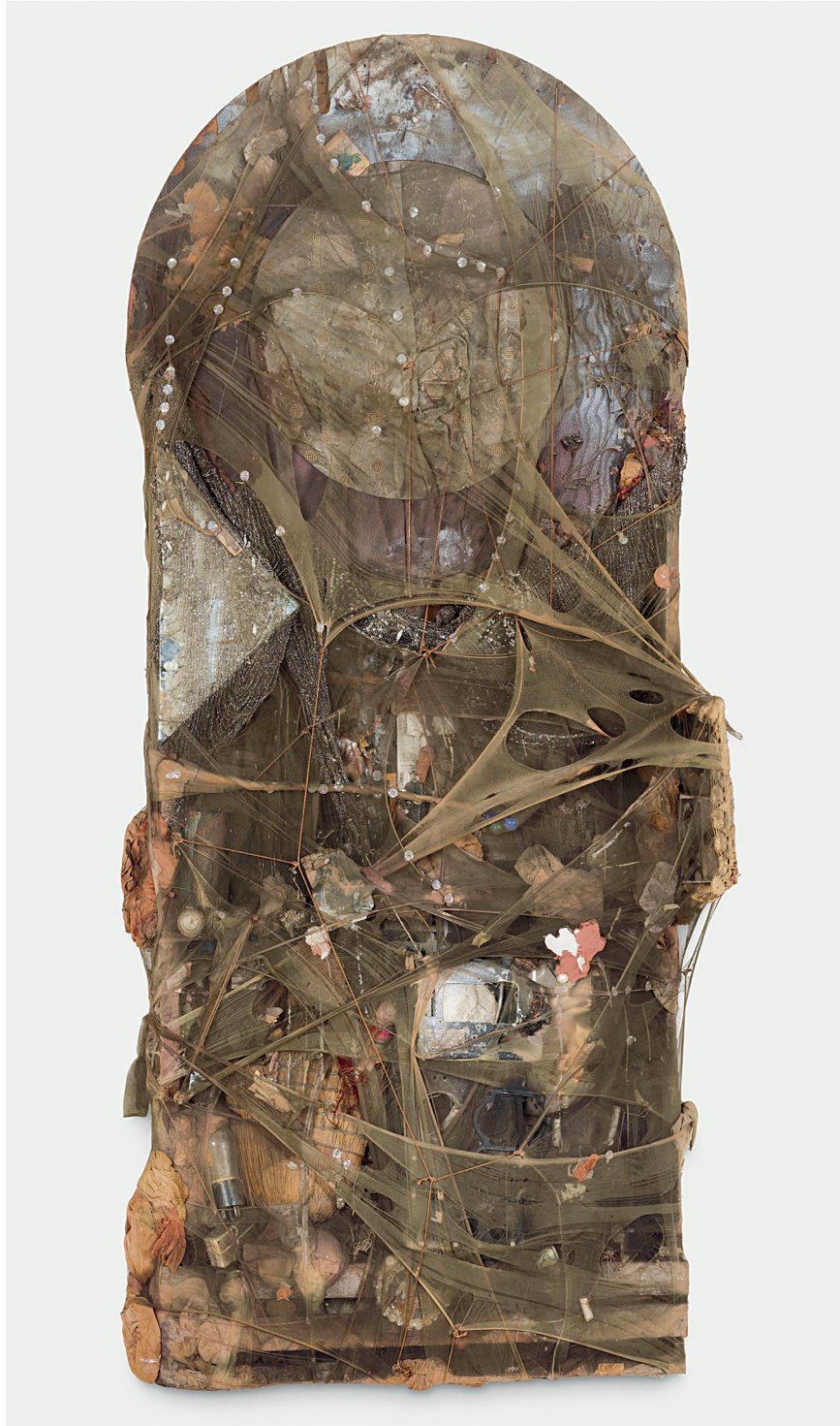
8 Bruce Conner, TEMPTATION OF ST. BARNEY GOOGLE, 1959, mixed media, 21.1 × 42 cm, Museum Moderner Kunst Stiftung Ludwig, Vienna