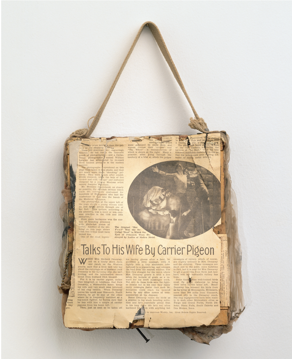
5 Bruce Conner, RAT BASTARD NO. 1 (back), 1958, wood, canvas, nylon, newspaper, photographic reproduction, wire, oil paint, nails, bead chain, etc., 42 x 23,5 x 7 cm, Collection Walker Art Center, Minneapolis, Gift of Lannan Foundation, 1997