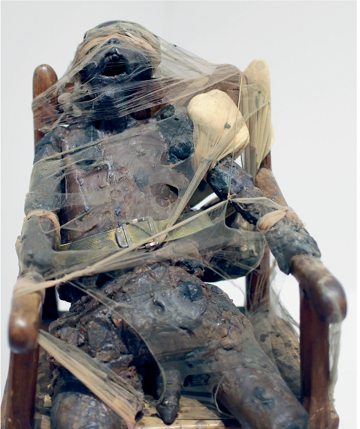
6 Bruce Conner, CHILD (detail), 1959, mixed media, 87.7 × 43.1 × 41.7 cm, The Museum of Modern Art, New York