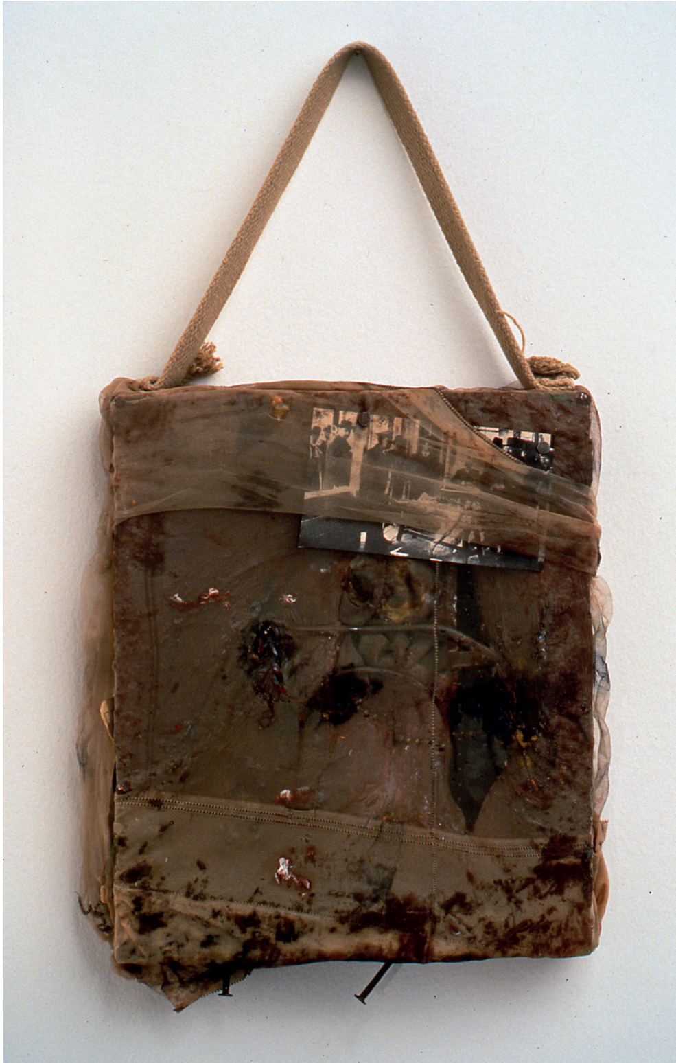
4 Bruce Conner, RAT BASTARD NO. 1 (front), 1958, wood, canvas, nylon, newspaper, photographic reproduction, wire, oil paint, nails, bead chain, etc., 42 × 23.5 × 7 cm, Collection Walker Art Center, Minneapolis, Gift of Lannan Foundation, 1997