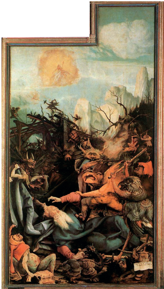
7 Matthias Grünewald, Temptation of Saint Anthony , 1512–16, oil on wood, 265 × 141 cm, Musée d’Unterlinden, Colmar

culture, a timeworn newspaper cartoon of a tattered, bug-eyed, racetrack tout that was first launched in 1919. But that comic indirection served Conner as a disingenuous alibi for his taking on the theme of demonic temptation in its most sublime artistic manifestation. In the legend of Saint Anthony, the desert hermit of the early Church overcame both the sensual enticements sent by Satan and the deadly blows of bestial creatures in a rocky, Egyptian cave. Among the many authoritative representations of the saint’s ordeal, the configuration of Conner’s assemblage points to one in particular: The Temptation of Saint Anthony by Matthias Grünewald on an inside wing of his testament to ultimate torment, the Isenheim altarpiece (fig. 7). Not for the last time, Conner would dispose his apparently improvised concatenations of disparate flotsam and nylon mesh into a composition that rhymes with the arrangement of an old-master painting. In the early literature of the Church, God was said to have observed Anthony’s mortal struggles from afar, only later praising him for his stalwart resistance to the swarming personifications of sin and evil. Grünewald places his divinity inside a loosely solar aura at the pinnacle of the composition, to which Conner responds with a shrouded lunar disk filling in the altar-like arch at the top of the