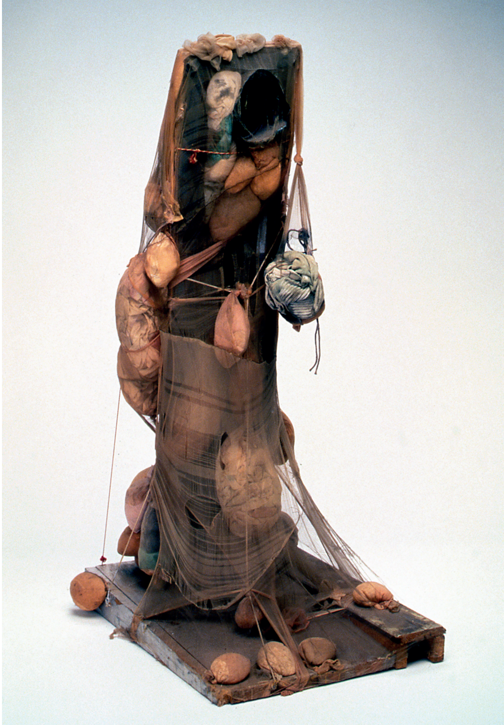
11 Bruce Conner, SNORE , 1960, mixed media, 92.7 × 44.5 × 54.6 cm, Fine Arts Museums of San Francisco