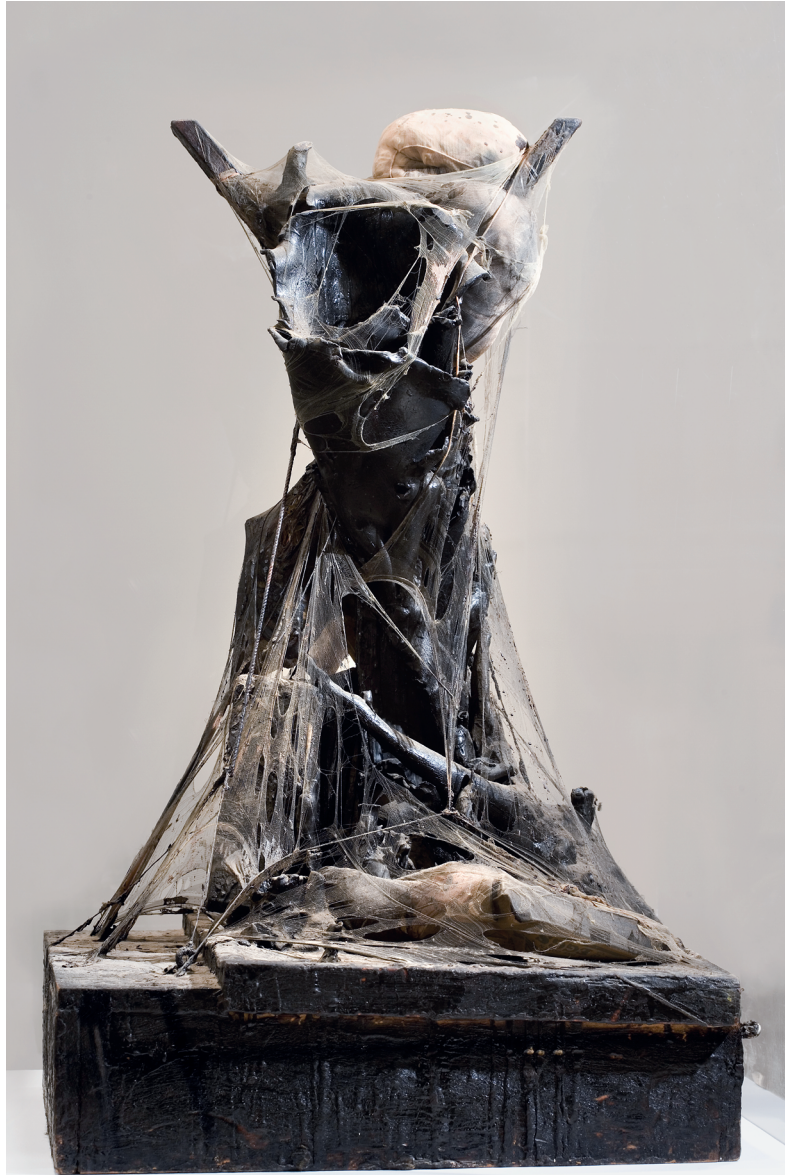
17 Bruce Conner, RESURRECTION, 1960, mixed media, 91.4 × 61 × 58.4 cm, Museum of Contemporary Art, San Diego

“beginning as it does with his desperation in the Garden and ending with his despair on the Cross. It is not a cathartic tragedy.” He shares with Conner the recognition that “Victimization, sacrifice, and religious violence have been forever unmasked as illegitimate strategies by which our murderous envy of each other is temporarily discharged, and yet preserved as an ongoing psychological orientation.” 28 That last phrase about “murderous envy” might be re-stated as “crucifixion of the spirit all the time,” and Conner came to a point in 1961 when he felt compelled to escape entirely the realm of the American war machine and the social sickness engendered by it.