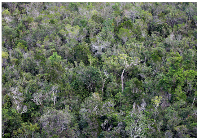
BELOW: Broadleaf evergreen forest