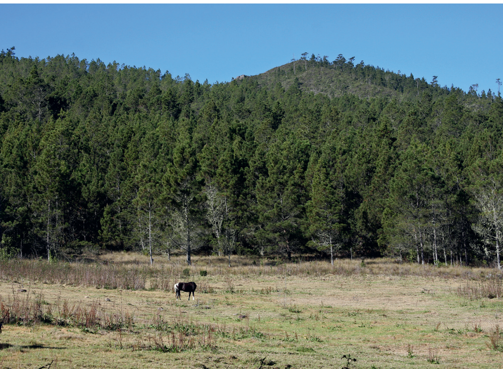
Sierra de Bahoruco—South Slope

Cabo Rojo and the Aceitillar sector of the Parque Nacional Sierra de Bahoruco lie just east of the border town of Pedernales, and are about half an hour west of Oviedo, with a good paved road all the way. Cabo Rojo and the Aceitillar sector are linked by the Alcoa Road, a paved road that remains from the bauxite mining operations of Alcoa. At sea level, and the southern terminus of the Alcoa Road, Cabo Rojo contains a small wetland across from the mine shipping port. This wetland attracts a fair number of waterfowl and shorebirds of all kinds, including the regional endemic White-cheeked Pintail, White Ibis, occasional Roseate Spoonbill, and wintering ducks and shorebirds. The mangroves here harbor good numbers of Yellow Warblers, an endemic subspecies, and many other nonbreeding warblers. North from Cabo Rojo, the road climbs steadily through desert thorn scrub to dry forest and broadleaf forest until reaching pine forest