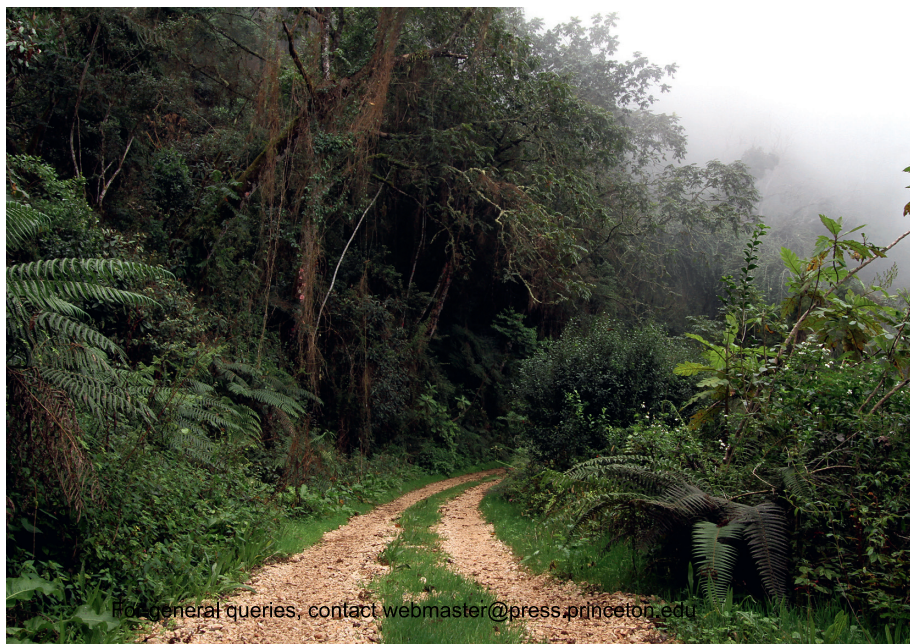
Sierra de Bahoruco—North Slope

From Rabo de Gato, one can follow the single road along the international border, but extreme caution is advised as the road is not well maintained and a 4x4 vehicle is essential. About 10 km beyond Rabo de Gato, and ascending in elevation, La Placa is a reliable spot for Bay-breasted Cuckoo and Flat-billed Vireo. At dawn and dusk, this is also one of the best places to see or hear Least Pauraque and Hispaniolan Nightjar. Continuing up the road for another 3–5 km, the area known as Los Naranjos has traditionally provided the most dependable sightings of Bay-breasted Cuckoo. About 3 km further on, the road enters a (normally) dry riverbed full of loose stone, and