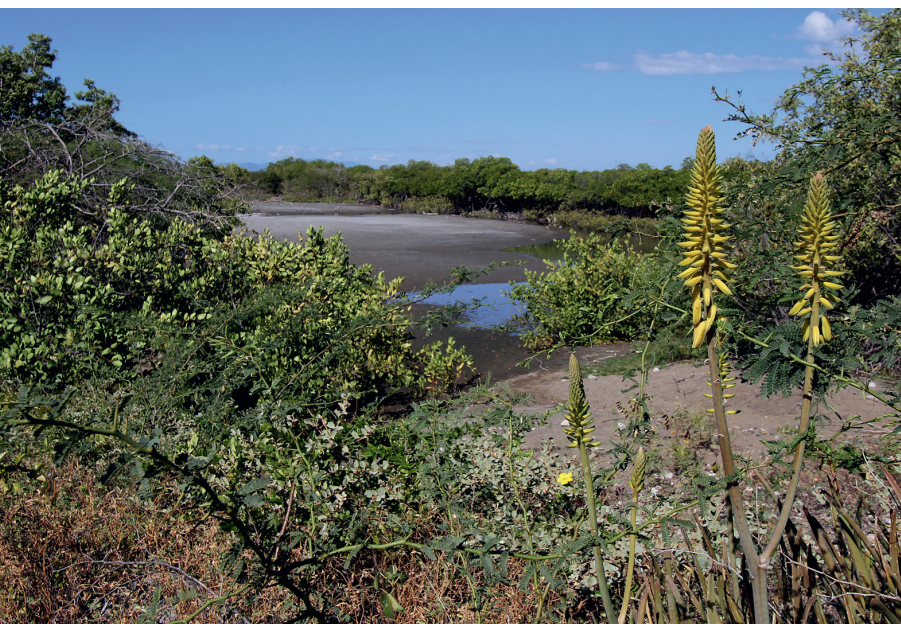
Salinas de Baní

Salinas de Baní is located some 60 km west of Santo Domingo, or about an hour-and-a-half drive, making it an ideal destination for a day trip from the city. The Salinas de Baní area is characterized by extensive sand dunes, inter-dunal swales, thickets, mangroves, salt-drying pans, lagoons, mudflats, and both sandy and rocky beaches. Many of these are not common habitats on Hispaniola, and the site therefore provides extremely important habitat for both migratory and nesting shorebird species. All egret and heron species present on the island may be seen here, as well as Clapper Rails and Whimbrels. Shorebirds are plentiful in the mudflats, coastal areas, and especially the salt pans. Nesting species at Salinas de Baní include Snowy Plover, Wilson's Plover, Least Tern, and Willet. Many warblers frequent the mangroves and thickets along the lagoons, and the bay often hosts boobies and other seabirds. Many Hispaniolan rarities have first appeared here, including Black-legged Kittiwake, Great Black-backed Gull, Lesser Black-backed Gull, American Golden Plover, Wilson's Phalarope, and Red-necked Phalarope. A spotting scope is recommended.