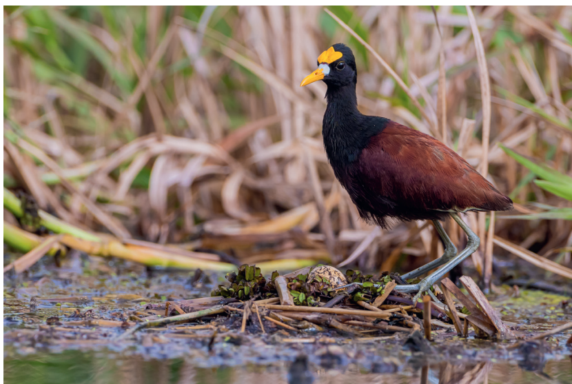
Northern Jacana occurs at Trou Caïman

the tiny village of Trou Caïman. At this point, look for a small entry in the brush barely wide enough to accommodate a vehicle. Beware of thorns when entering, and also soft ground under the grassy area next to the shoreline. From this point, one can view a portion of the cattail habitat and a large portion of the lake.