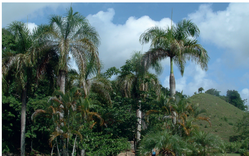
Parque Nacional Los Haitises

One popular and pleasant route to visit Los Haitises is by hiring a boat and guide from Caño Hondo, proceeding down a river through mangroves to the Bahía de Samaná, and then stopping at various points to explore trails on the margins of the park that pass through lowland broadleaf forest. Otherwise access to Los Haitises is quite difficult. The best way to visit interior areas is to contact the park office where you can hire a guide who is familiar with the park. Please note that the trails in Los Haitises are not well maintained and can be lined with nettle and other irritant plants. Trails are often rocky and slippery due to the geological characteristics of the area and frequent afternoon rains. Humidity levels can reach 95% in the forest. Arrive early and carry plenty of water.