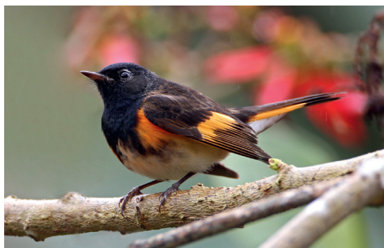
American Redstart may be seen in the Jardín Botánico Nacional