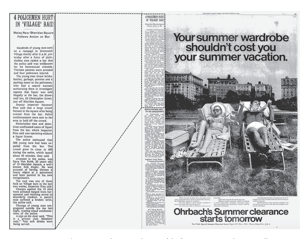
FIGURE 0.2. The account in the New York Times of the famous uprising at the Stonewall Inn ran without a byline and focused on harm to policemen. "4 Policemen Hurt in 'Village' Raid." June 25, 1969, p. 33.

UNCOVERING A HISTORY OF SOCIAL MOVEMENTS 5