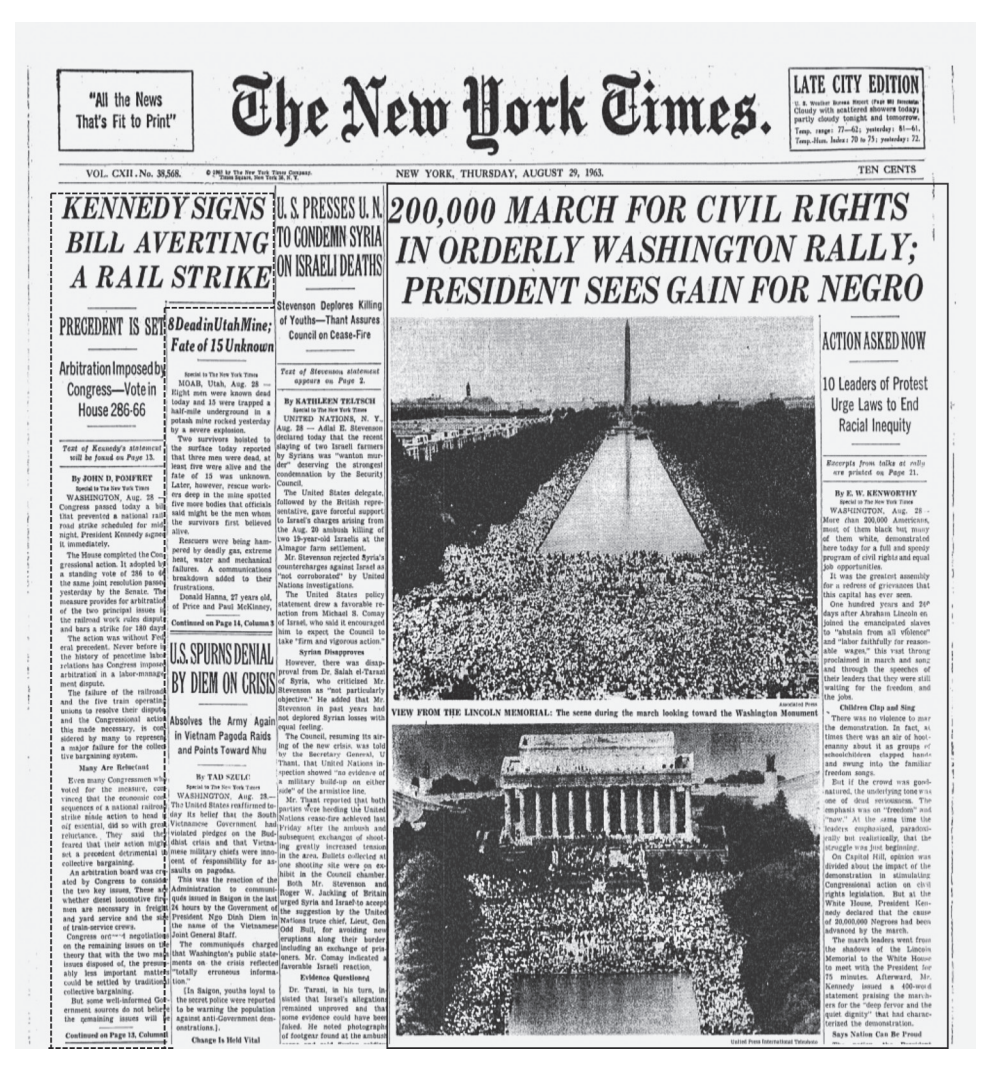
FIGURE 0.3. The March on Washington for Jobs and Freedom received extensive play on the front page of the New York Times , but there was longer-running coverage of legislation seeking to avert a national railroad strike.

similar, as figure 0.4 shows. But the Teamsters' news coverage was often quite negative and harmful to the organization as well as to the labor movement as a whole—an issue that points to the importance of the quality of coverage received by organizations.