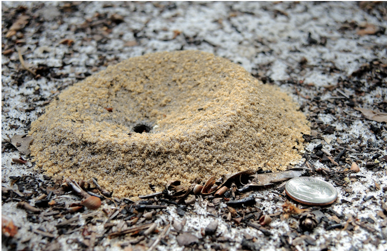
FIG. 1.1. A soil dump resulting from the excavation of a nest below. The generally crater-like form is typical of many ants, but far from all. Note the US dime for scale. This crater was formed by Dorymyrmex bureni .

Under our feet lies a mysterious invisible realm. Heaps of soil in the shape of craters, mounds, or strewn pellets (fig. 1.1) hint at its existence. Although many creatures burrow in soil, most of this soil is brought up from below by ants during the excavation of their nests. Ant-made soil piles occur in a wide range of habitats and locations, from the rain forests of Uganda to the sidewalks of Los Angeles (to the degree that these sidewalks exist). Because ants vary enormously in body and colony size as well as in nesting habits, these deposits range from almost invisible to the obvious mounds of fire ants or Allegheny mound-building ants, or the colossal excavations of the leafcutter ants of tropical America, which can occupy as much belowground volume as a modest-sized house.