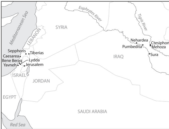
FIGURE 1.2. Map of Palestine/Babylonia

prioritization—it was produced as part of this new cultural commitment to Torah above all. Second, because it is the cause of this increased prioritization—its discourse of reception made it into the central piece of a religion built around scholasticism as religious devotion. Within a religious production that has rewritten its story and changed its lead from God to Torah, the part of Torah has been played for over a millennium by the Babylonian Talmud.