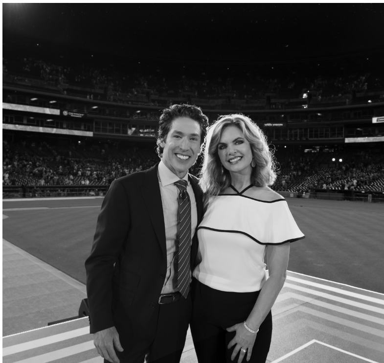
Victoria and Joel Osteen, who lead the country's largest church, are an iconic pastoral couple and an example of the heights to which a pastor's wife can climb.

conservative traditions 16 that did not ordain women or, if they did, rarely promoted them.