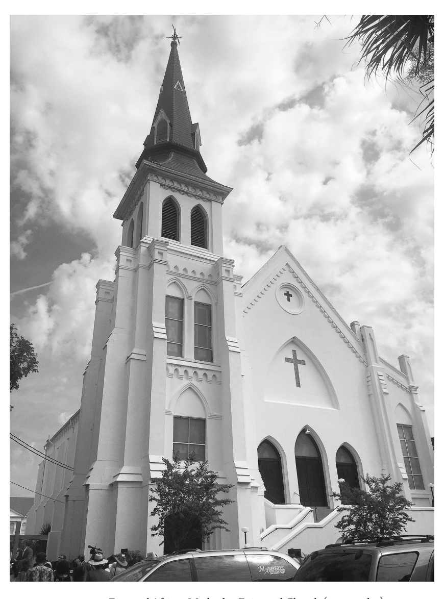
FIGURE 2. Emanuel African Methodist Episcopal Church (present day).