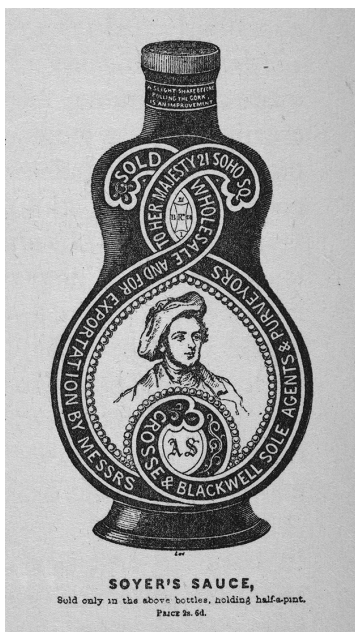
FIGURE 1.5. Nineteenth-century advertisement for Soyer's Sauce.

Americans were what he called “an individual-loving people.” 28 New visual media catered to that affection. In the 1860s, affordable, compact photographs of celebrities became widely available in shops and via mail order. In the 1890s, heavily illustrated niche magazines devoted to stage stars began to flourish, anticipating the movie magazines that became popular in the 1910s. 29