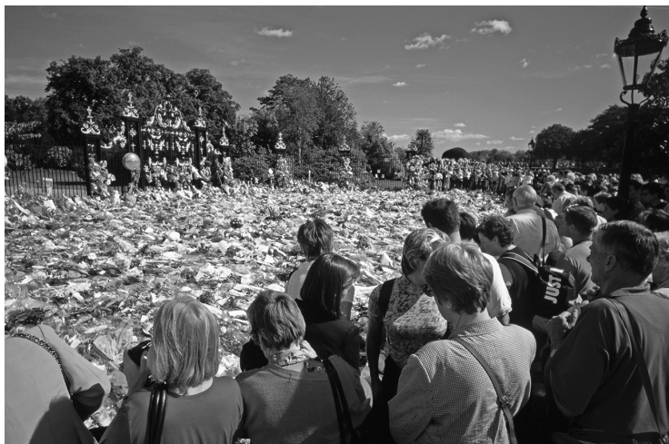
FIGURE I.3. Flowers and mourners at Kensington Palace after Diana's death, September 1997.

proxy for debates about what it meant to be a woman, a mother, a wife, a member of the elite, and, most fundamentally, a human being worthy of admiration. The participants in those debates included the other celebrities in Diana's orbit; the journalists reporting on Diana, often competing with one another for access to her and for the public's interest and attention; and the many people who identified, for diverse reasons, with a privileged person who nonetheless faced challenges similar to their own.