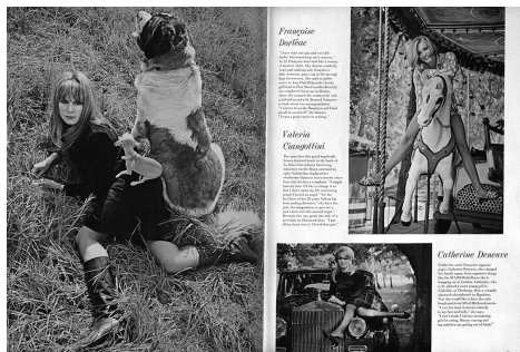
FIGURE I.2. "The New Beauties," Life magazine, January 28, 1966, pages 46–47.

1970s, starred opposite rock star David Bowie in a 1983 vampire movie, and launched her own perfume and fashion lines. In 1971, she was one of 343 famous French women who publicly acknowledged having had illegal abortions. In 2018, she lumbered into #MeToo territory when she signed an open letter that denounced women protesting harassment as waging war on sexual freedom, then quickly apologized to the many whom her stance offended.