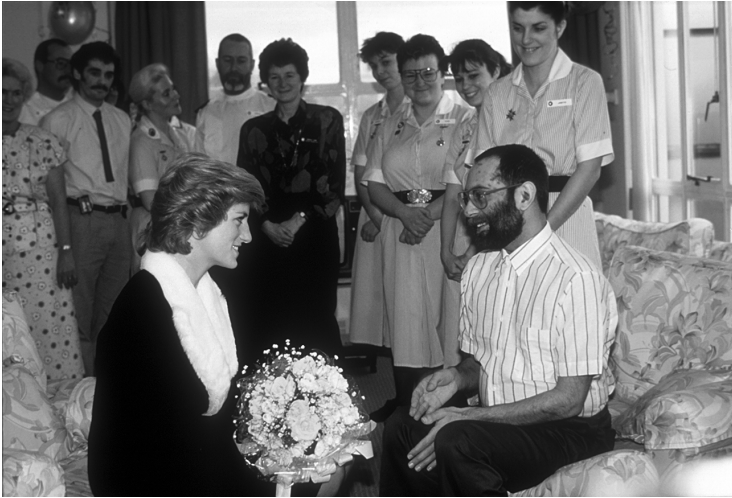
FIGURE 1.4. Diana, Princess of Wales, and Martin, Mildmay Mission Hospital, February 24, 1989.

Because publics, members of the media, and celebrities themselves all actively shape what it means to be a celebrity and to be interested in celebrities, their contests are too evenly matched for their outcomes to be easily predicted. That unpredictability makes celebrity culture a suspenseful, interactive, serial drama. Though the drama of celebrity has momentary winners and losers, its contests never definitively end; the resulting suspense keeps millions engaged. 12 All three entities in the drama of celebrity have many moves at their disposal. Publics influence media coverage by deciding which stars to follow and which media to consume. They can send letters to editors, post online comments, or, in live settings, choose between boos and applause. Some fans create their own celebrity materials, but most content themselves with collecting and arranging materials produced by others. A few actively seek contact with stars or try to influence them by offering criticism, praise, and advice. Many prefer to idolize celebrities from afar and to experience them as transcendent and overpowering. Celebrities, too, vary in the degree of say they have over their self-presentation and careers. Some cede or lose control to photographers and journalists, while others obsessively craft their own personae and find ways to connect directly with publics. Journalists in turn can