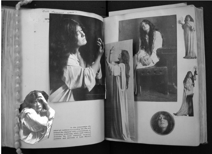
FIGURE 1.7. Clippings of Julia Marlowe as Lady Macbeth, TRI Scrapbook #111.

journalism. Whenever possible I have cited newspaper articles found in albums, because the fact that an actual theatergoer clipped and preserved them increases their historical significance. Today, the albums preserved in rare book collections often sit neglected, yellowing and crumbling, but these underused sources have a rare capacity to communicate the passionate feelings that celebrities aroused over a century ago. For that reason, scrapbooks play a starring role in many of the chapters to follow.