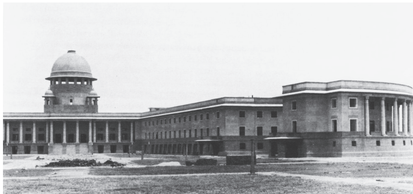
FIG. 0.3. The newly built Supreme Court of India, 1958.

in newspapers. A recent study showed that more articles in leading English newspapers discussed the Supreme Court than the parliament or the prime minister. 73