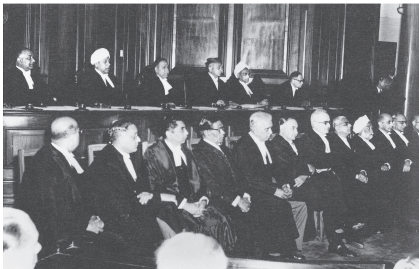
FIG. 0.1. Inaugural Sitting of Judges of the Supreme Court of India in the former Chamber of Princes, 1950.

princely states looked down upon the original eight judges as they deliberated their cases. In 1956, emphasizing their growing disagreement with the legislature, the now eleven judges moved to their own seventeen-acre complex a mile away.