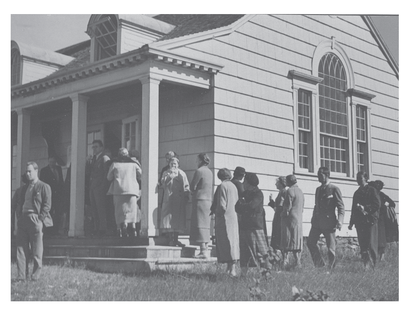
Figure 6. Participants at Bailey Island Hall.