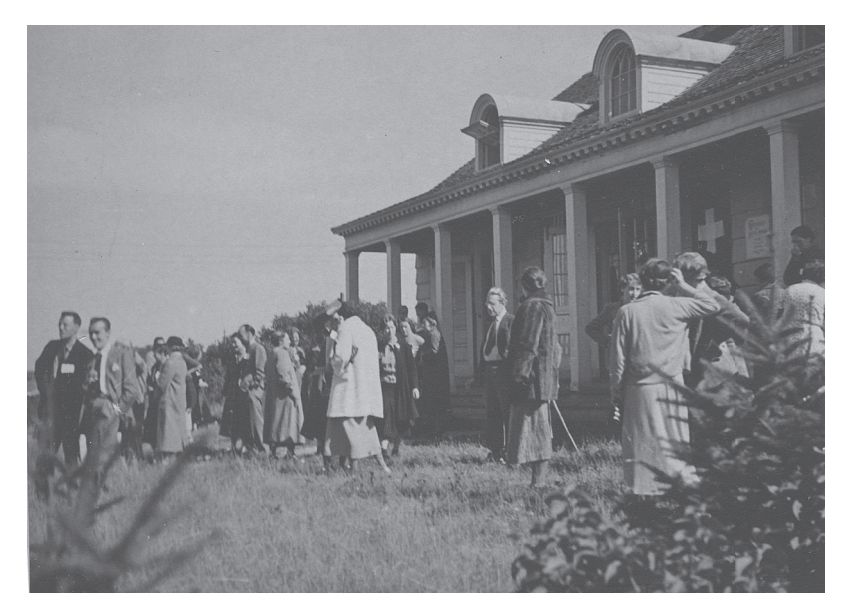
Figure 4. Participants at Bailey Island Hall.