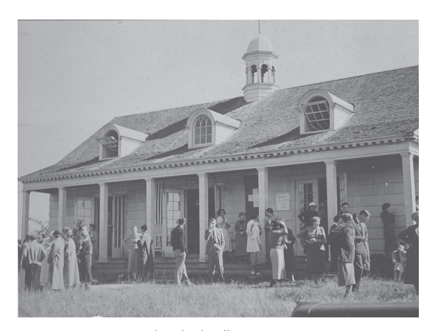
Figure 5. Participants at Bailey Island Hall.