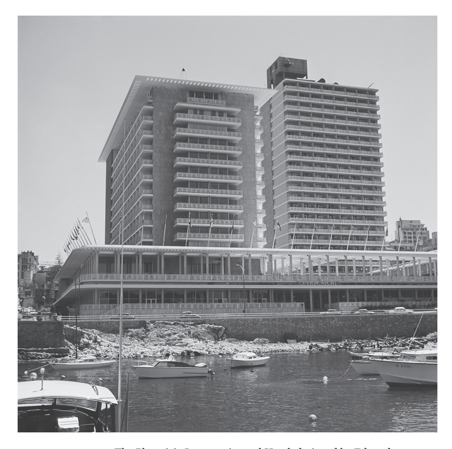
FIGURE 2. The Phoenicia Intercontinental Hotel, designed by Edward Durell Stone, opened 1961.