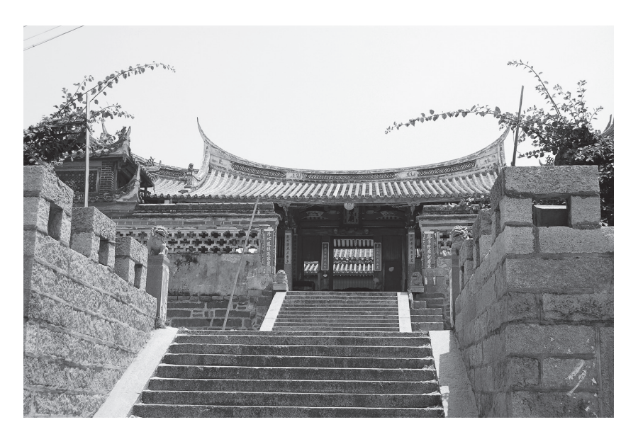
1.2. Temple of the God of the Wall, Pinghai

Year. They carry their God of the Wall in a procession around the town on the ninth day of the new year. (The Chinese term Chenghuang is usually rendered in English as the City God; but Pinghai is not a city, so in this case the more faithful translation is also the more accurate.) The festival is a riot of sensation—firecrackers and handheld cannons fill the air with flame and smoke; the colorful costumes of the god's bearers and hundreds of accompanying horsemen come in and out of view through the thick incense smoke; the women of the village chant prayers as they sweep the road in front of the procession and take lit sticks from the god's heavy incense burner (figures I.2-I.4). The walls of Pinghai have long been destroyed, but the procession stays within the area that used to be demarcated by those walls and does not enter the surrounding villages. Every year as he tours the precincts of the town to receive offerings from his devotees and to expel evil influences and ensure good fortune in the coming year, the God of the Wall thus also marks Pinghai residents off from the villages of the surrounding area, even centuries after the military base at Pinghai itself was disbanded.