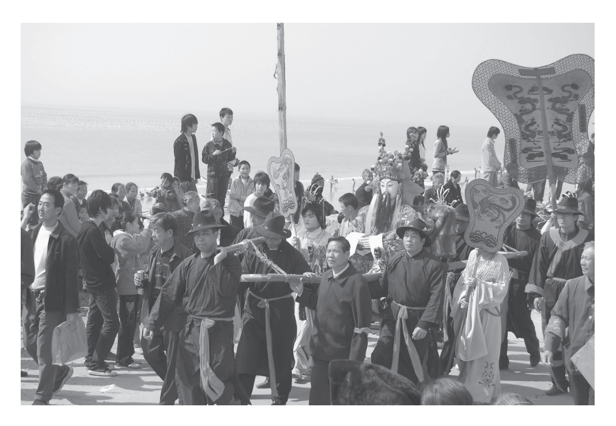
1.4. Pinghai procession festival