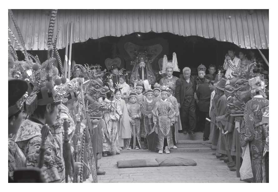
1.3. The God of the Wall, Pinghai

the Marquis of Jiangxia, was one of the oldest and closest supporters of the founding emperor of the Ming. When the emperor needed a reliable lieutenant to set up defenses on the southeast coast of his empire, it was Zhou to whom he turned. In the 1370s, Zhou Dexing marched his forces to Fujian. They uprooted tens of thousands of men from their home villages, conscripted them, registered their families as military households, and forced them to labor building the walled forts where they would ultimately serve. Pinghai was one such fort, built by the ancestors of the very people who live there today. When the fort was first established, a temple to the God of the Wall was built and an image of the god installed in it. At some point in the succeeding centuries, the people of Pinghai came to the realization that the God of the Wall of their own town was none other than the spirit of Zhou Dexing. So when the people of Pinghai today parade their god in the hopes of ensuring good fortune in the year to come, they are not simply repeating a timeless expression of Chinese culture. They are also commemorating a historical moment, the foundation of their community centuries ago. Their commemoration in the twenty-first century speaks both to the formation of local identity and to remarkable historical continuity. History has produced this ritual. The procession is—among other things—a story of the ancestors' interaction with the Ming state.