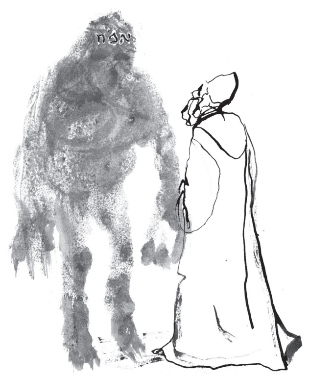
1.2. Rabbi Loew brings the golem to life.

timating it, let alone by overestimating our own influence as its creators, witnesses, or critics. There cannot be any doubt: since the nineteenth century, science has dramatically changed the human condition in terms of energy provision and food production, through the introduction of new materials and new forms of transportation and communication, and with new pharmaceuticals and advances in medical care. Now the very survival of our culture in the Anthropocene may depend on the production of the appropriate scientific and technological knowledge.