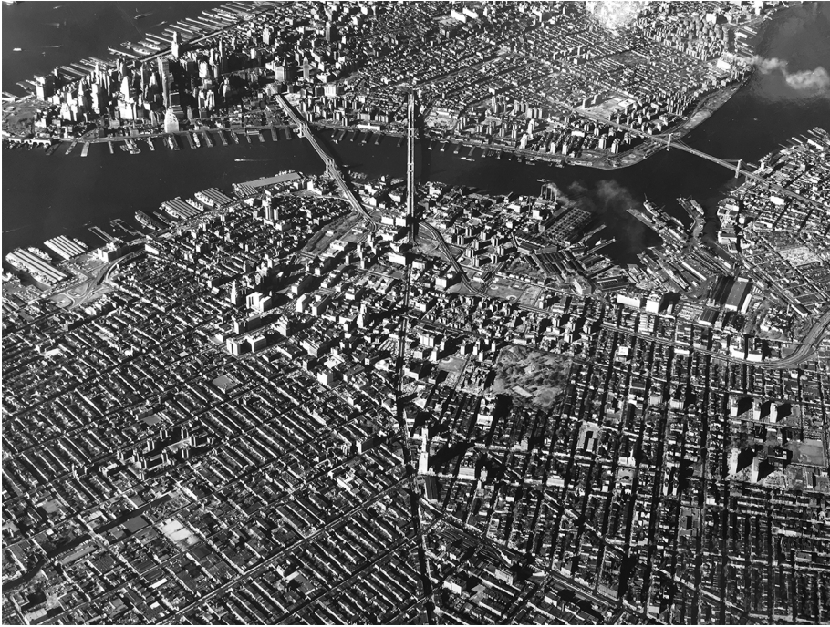
High view of downtown Brooklyn, 1962.