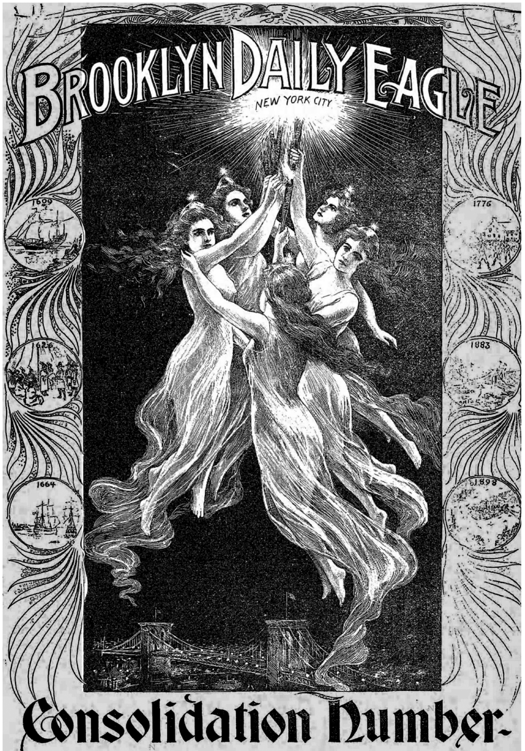
"Consolidation Number," an 1897 special edition of the Brooklyn Daily Eagle celebrating the coming formation of Greater New York City, with the five boroughs rather improbably represented as virginal maidens.