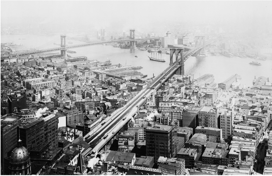
Linked fates: looking east toward Brooklyn from the Woolworth Building, 1916.

the Lower East Side, channeling tens of thousands of working-class Germans, Scandinavians, Jews, Italians, Poles, and Irish into Williamsburg, Bushwick, Greenpoint, Red Hook, Sunset Park, and the industrial district west of the Navy Yard. By the mid-1920s a residential building boom unprecedented in US history had created a vast tapestry of middle-class streetcar suburbs across Brooklyn's outwash plain, where young families could find "room to swing a cat," as P. G. Wodehouse and Jerome Kern versed it in "Nesting Time in Flatbush." The coming of so many Catholic and Jewish southern and eastern Europeans in this era was a last straw of sorts for Brooklyn's Anglo-Dutch elite. By the late 1920s they were fleeing in droves for the upscale suburbs of Westchester, Long Island, and New Jersey. My mother used to recall how, on walks with her father in the 1930s, she would marvel at the aged Anglo-Dutch widows sweeping the stoops of their glorious brownstones on South Oxford Street; last of their breed, they were relics of a lost world whose families had long ago fled to Scarsdale, Bronxville, or the North Shore.