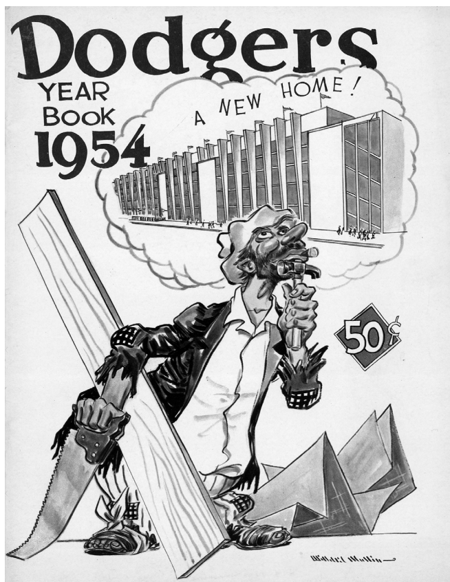
Cover of the 1954 Dodger's Yearbook, envisioning a dream that would never happen—not in Brooklyn, at least.